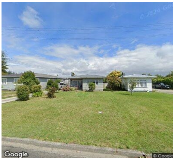
Google Streetview Image